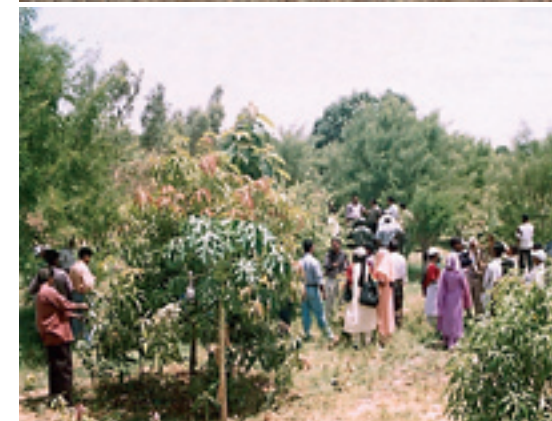
Zone C Clockwise from bottom left - Wadi development - Watershed development - Participatory Irrigation Management