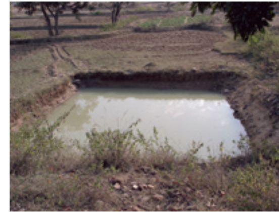
Zone A Clockwise from bottom left - 5% farm pond model - Revival of traditional irrigation systems-Ahar-Pynes of Palamu, Jharkhand - System of Rice Intensification (SRI)