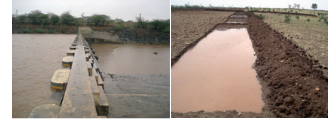
Zone D - Water resources augmentation