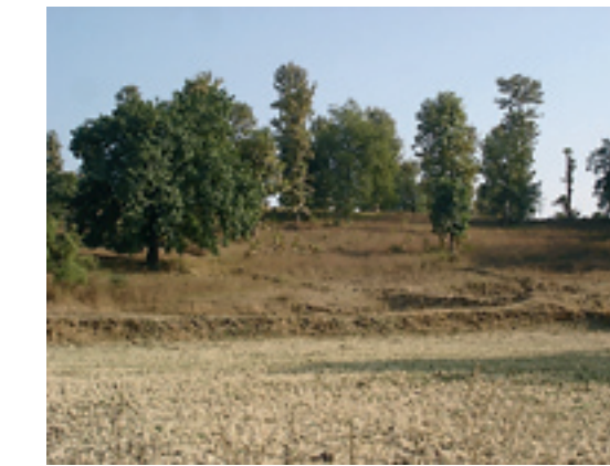
Zone B - Strengthening forest based livelihood